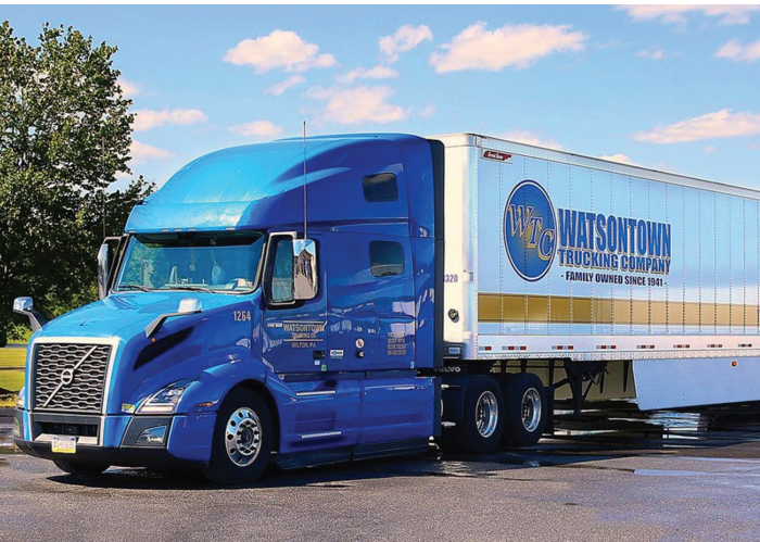
ON-DEMAND TRANSPORTATION CAPACITY THROUGH WATSON TRUCKING COMPANY