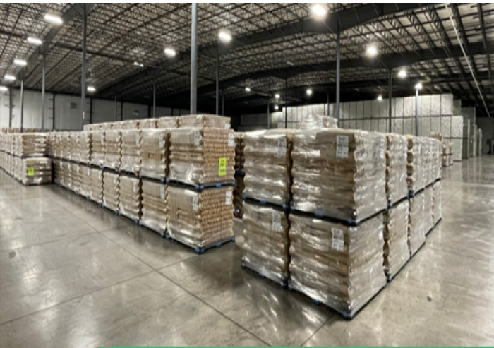
ESFR SPRINKLER SYSTEMS